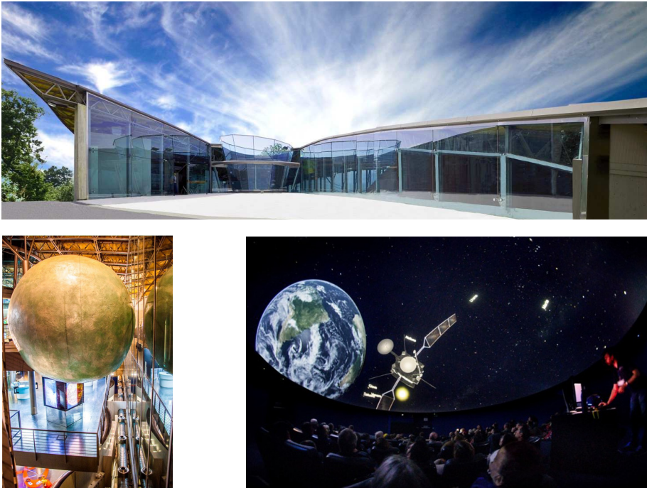
Fig. 3. The Astronomical Park Infini.to: the main entrance; an image of the interiors; the planetarium.